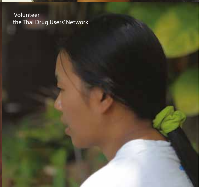
Volunteer the Thai Drug Users' Network