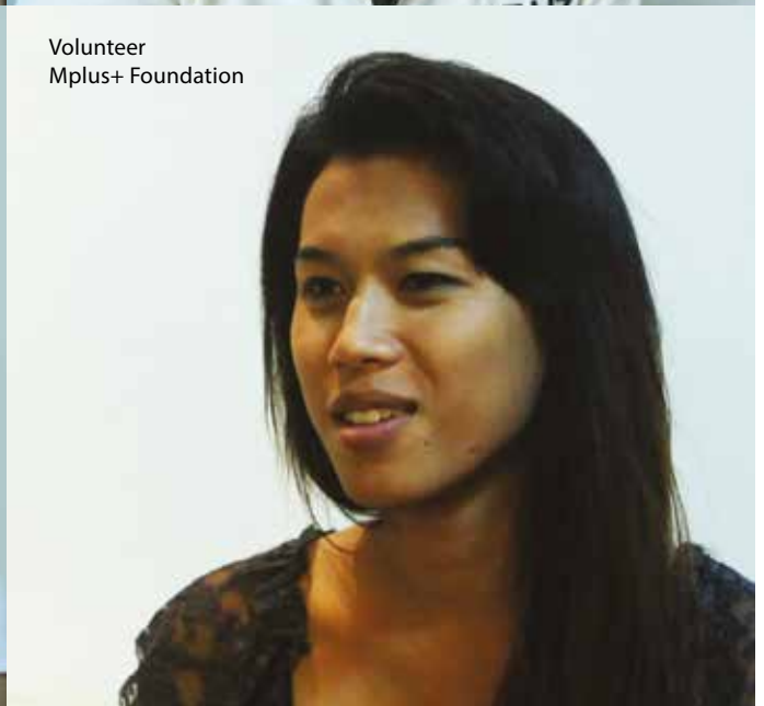
Volunteer Mplus+ Foundation