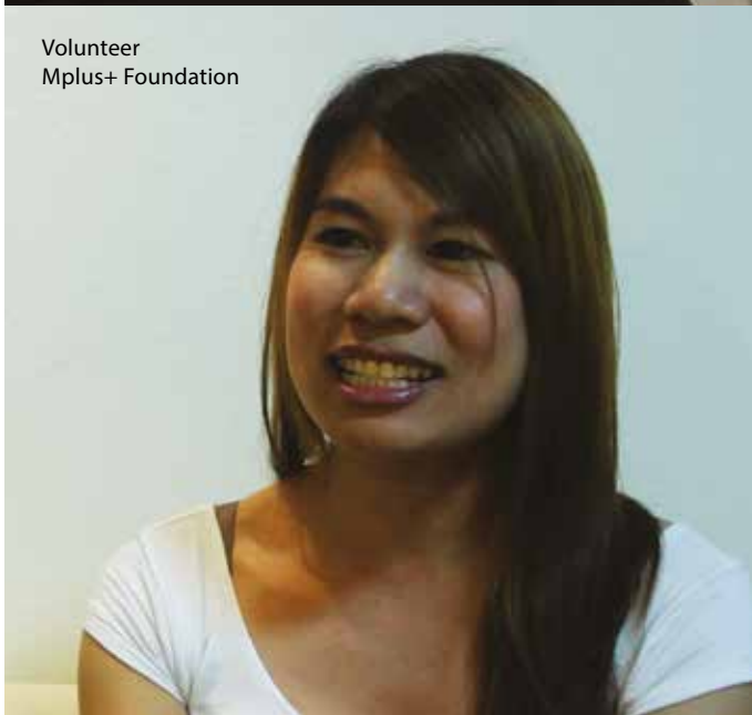
Volunteer Mplus+ Foundation